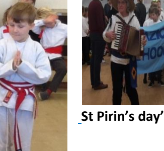
'All around the world'